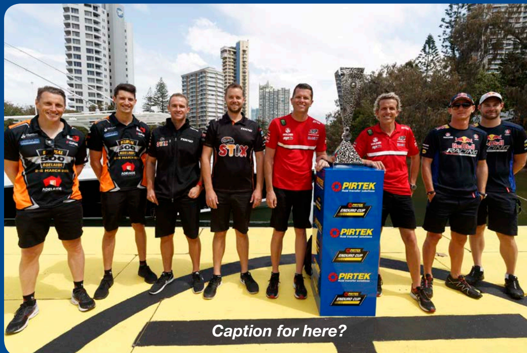
Caption for here?