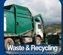
Waste & Recycling